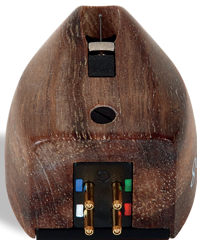
ABOVE: The chestnut shell is bolted onto the N°8's alloy body via a small screw. The colour-coded pins are well spaced and easily accessible